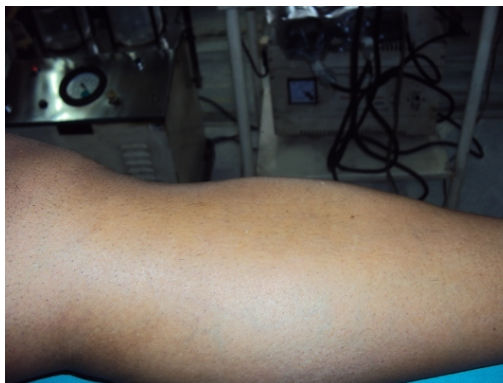
Fig. 1: Pre-op photograph of affected leg showing diffuse bulge of anterior compartment of leg.

A 40 year old man with a history of blunt trauma in left leg 6 years back, presented with pain in left leg for last one year. The pain progressively increased on exertion and was relieved with rest. There was no history of backache or radiculopathy. He gave no history of smoking. Local examination of leg was unremarkable except for slight bulge of muscle in anterior compartment of leg [Fig.1]. His peripheral pulses and reflexes were normal with no evidence of varicose veins and sensorimotor deficit of lower limbs. Routine blood and urine examination was normal with no abnormality seen on lower limb X-ray. CT spine to rule out spinal canal stenosis did not reveal any abnormality. Empirical treatment of leg pain failed to relieve his discomfort. Persistent questioning about leg pain revealed increased swelling of leg anteriorly after exertion and at time of increased leg pain. On examination a non-tender bulge of tibialis anterior was found after prolonged standing. Muscle hernia of leg was suspected and confirmed by ultrasound examination which showed 10 x 5 cm bulge of tibialis anterior muscle belly through weak covering fascia on muscle contraction.