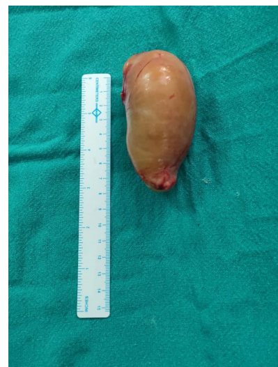
Fig.3: Dissected specimen.