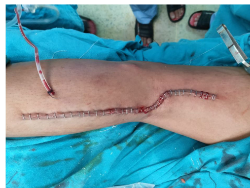
Fig.4: Immediate post-operative closure.