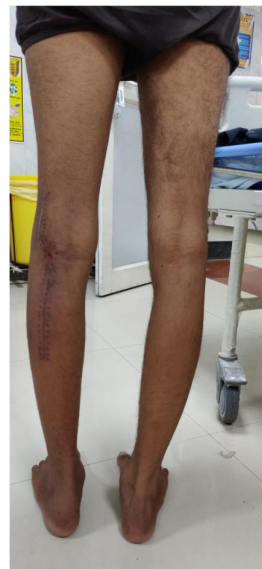
Fig.5: Post-operative scar at 10 weeks with full knee extension.

Schwannomas arising from posterior tibial nerve are rare and a high index of suspicion with meticulous clinical examination is necessary for its timely diagnosis. Preoperative radiological and tissue diagnosis will also help explain the prognosis of