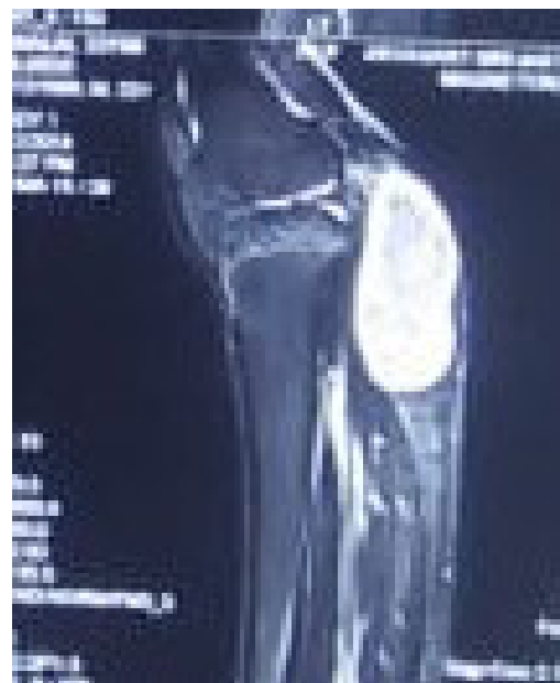
Fig.1: MRI showing schwannoma of the tibial nerve in the popliteal fossa and proximal leg.

spine examination revealed no abnormality. On physical examination of the knee, a palpable mass of size approximately 10×5×4 cm was found on the proximal one third of the posterior surface of leg. The mass was firm and tender on palpation. Tinel's