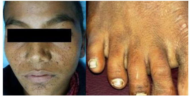
Fig.1: Adenoma sebaceum on face and eye lids and periungual fibroma on foot.

Tuberous sclerosis (TS), also known as tuberous sclerosis complex or Bourneville disease, is a neurocutaneous disorder characterized by development of multiple benign tumors of the embryonic ectoderm (e.g. skin, eyes, and nervous system). The clinical triad of papular facial nevus, seizures and mental retardation is found in less than half of the patients. The radiological hallmarks of this neurocutaneous syndrome are universally accepted as sufficient for diagnosis [3]. Tuberous sclerosis was classically described as presenting in childhood with a triad (Vogt triad) of seizures (absent in one-quarter of individuals), mental retardation (up to half have normal intelligence), adenoma sebaceum (only present in about three-quarters of patients) [4]. The full triad is only seen in a minority of patients (30%). Therefore, TS has a wide clinical spectrum. The diagnosis of definitive TS is based on specific clinical features and requires the presence of two major criteria or one major and two minor criteria [5]. Pulmonary lymphangiomyomatosis, renal angiomyolipoma and facial angiofibroma are some of the major clinical features. The most frequent cause of death in patients with TS is renal complication [6].