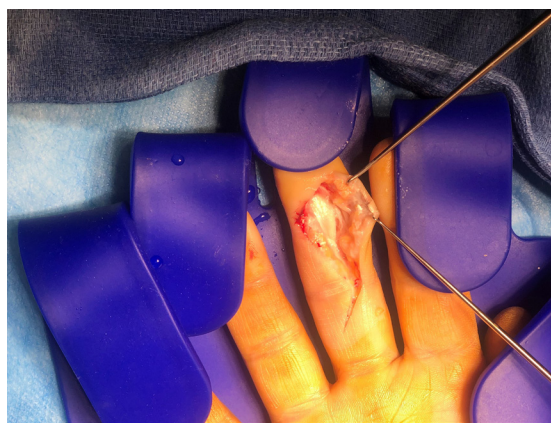
Fig.3: Per-operative findings after Bruner incision, showed extensive wound infiltration of white latex between P2 and P3.

removed. When applying a tourniquet, don't wrap the arm with an Esmarch bandage in order to avoid further spreading of the injected material [1,2]. Wide exposure of the injected area needs to be taken into account through extensile exposures (either mid-lateral or Bruner).