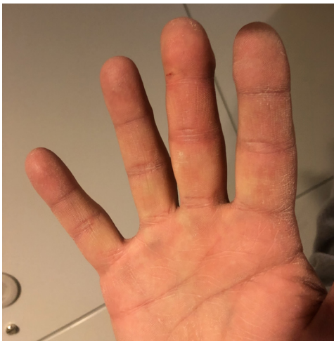
Fig.1: Aspect of the middle finger on presentation in the emergency department. Note the minimal punctiform injection site between P2 and P3.

tenolysis without harming the pulleys and minimal debridement took place in order to exclude latex paint infiltration in the flexor tendon sheet. Since the exploration could rule out latex infiltration at this level, irrigation of the tendon sheet was judged not necessary. The non-surgical treatment consisted of: paracetamol and ibuprofen, triaxis vaccination for tetanus prophylaxis, elevation of the wound and post-operative amoxi-clavulanic acid during 7 days. Post-operatively, antibiotic treatment, intensive physiotherapy and revalidation followed. After 6 weeks, the patient could resume his profession but complaints of residual finger morning stiffness remained.