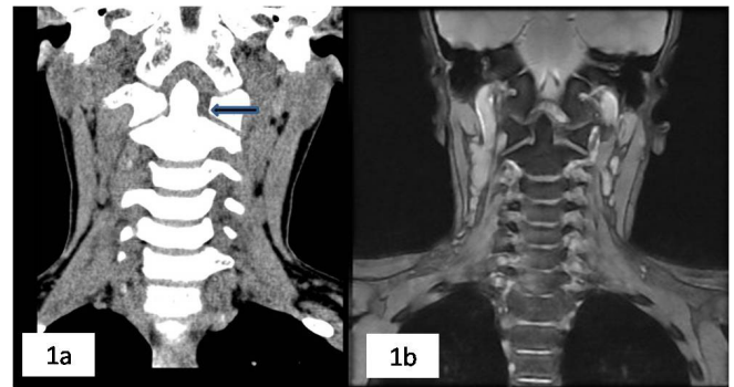
Fig.1(a): Cor reformatted CT, (b): Cor T2W MRI images reveal laxity of the left alar ligament with increased atlanto-axial distance (arrow) owing to lateral subluxation at the atlanto-axial joint.

Our patient had similar clinical presentation except Sudeck's sign was negative. Although