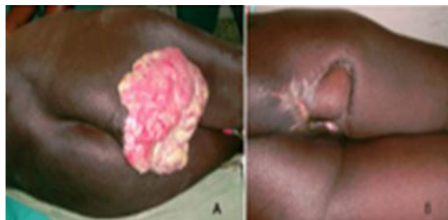
Fig.1(a): Pre-operative picture (b): post-operative picture after 10 years.

An excision biopsy with 10 cm of unstretched skin was carried out; the excised specimen included the lower half of the gluteus maximus [Fig.1]. A tensor fascia lata myocutaneous flap with de-epithelized pedicle was tunneled and used to reconstruct the defect. The histopathology revealed dense fibrocollagenous tissue occupied by a hyper-cellular mesenchymal lesion formed by elongated cells with thin fibrillar cytoplasm and spindle fairly uniform but hyper-chromatic wavy nuclei. There is variable cellularity with myxoid relatively pauci-cellular areas in which collagen is often disposed in a "shredded carrot appearance". Mitoses are frequent in some areas. Immunohistochemistry showed that the tumor cells are negative for EMA, MNF116 and S100. The features are consistent with a malignant peripheral nerve sheath tumor. These results were consistent with the initial incisional biopsy report [Fig.2]. He was commenced on cyclical combination chemotherapy using cisplatin based regime. He