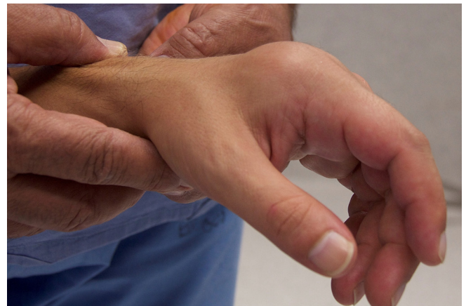
Fig.1: Swelling in the second metacarpal bone.

a mass in the second metacarpal of the left hand. There had been progressive growth over at least four years, without accompanying symptoms and without functional impairment [Fig.1]. The patient did not present other masses of similar characteristics. An X-ray was performed and showed an osteolytic and expansive lesion of the distal end of the second metacarpal [Fig.2,3]. Resection and reconstruction with autologous free fibular graft was decided.