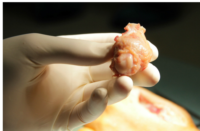
Fig.4: Mass after excision.

At three years of follow-up, there is good integration of the graft and no recurrence [Fig.7,8]. The patient has good overall hand function with