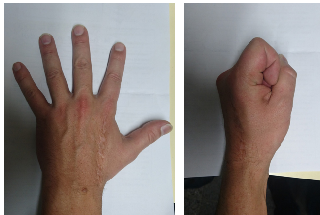
Fig.9,10: AP and lateral hand view.

The use of free or vascularized fibular grafts is widely described in traumatology and oncology. Vascularized grafts are technically more difficult but tend to present lower rates of non-union. The free graft union rates are as high as 89% [8,9]. Possible complications are delayed union or nonunion, stress fractures and infection. The