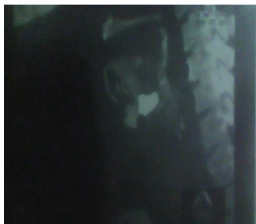
Fig.3: Sagittal section of CT scan showing the shell.