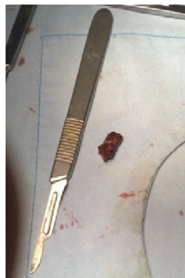
Fig.4: The shell removed from the larynx.