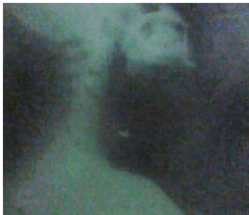
Fig.1: Plain x-ray of the neck showing the shell.

in the right side of neck consistent with a shell [Fig.1]. Axial and coronal computed tomography (CT) of the neck further confirmed the presence of shell between two pieces of fractured right thyroid cartilage lamina with minimal fracture displacement [Fig.2,3]. A decision for exploration was made after informed consent and the patient was prepared for surgery. Under general anesthesia, in supine position the neck was explored through a transverse incision and the strap muscles were split in the midline to expose the laryngeal skeleton. Partial laryngofissure was made via midline thyrotomy and the foreign body [Fig.4] was extracted from between the fractured parts of the thyroid cartilage which were approximated and fixed with nylon 3/0 suture and the wound was closed in layers over a drain. Post-operatively, the patient was given systemic antibiotics and antacids for few days. Drain was removed two days after exploration with no further edema or collection. Patient had a smooth post-operative course with no complications. Voice improved dramatically and we received no complaints from the patient regarding speech or feeding. Prior to discharge, fiberoptic laryngoscopy was normal. Patient was seen six weeks and one year after discharge where no abnormality was found by fiberoptic laryngeal examination.