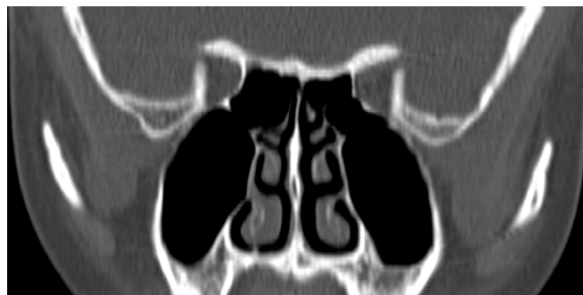
Fig.1: Normal sinus coronal position CT showing absence of inflammation in nasal cavity and sinus.

Following the antiviral treatment, the headache was almost relieved, except that the