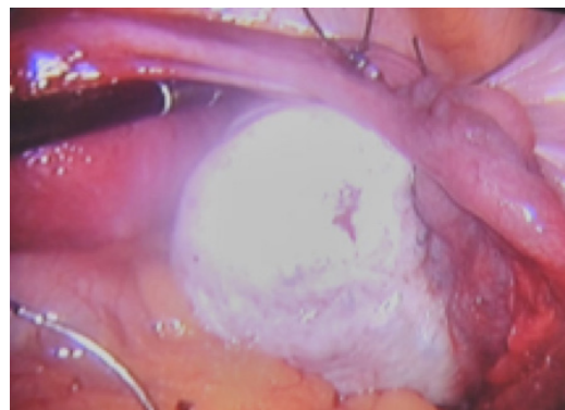
Fig.3: Right ovary fixed to the ipsilateral round ligament after detorsion.

The same mechanism explains the torsion in this case as ovary was normal without any cysts. These anatomical factors resulting in torsion after so many years after menarche makes this case unique.