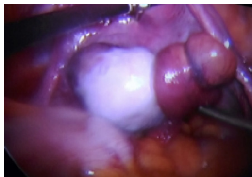
Fig.2: Intra-operative right adnexa twisted twice over its pedicle.