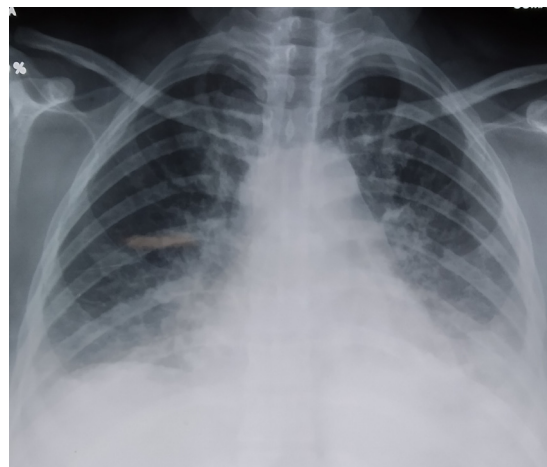
Fig.1: Chest radiograph showing bilateral airspace consolidation.

DENV is the commonest human arbovirus infection worldwide. After the incubation period, the disease begins abruptly and passes through three phases: febrile, critical and recovery phase. The severe forms of dengue are characterized by plasma leakage, thrombocytopenia, and hemorrhage. At times, dengue infection may result