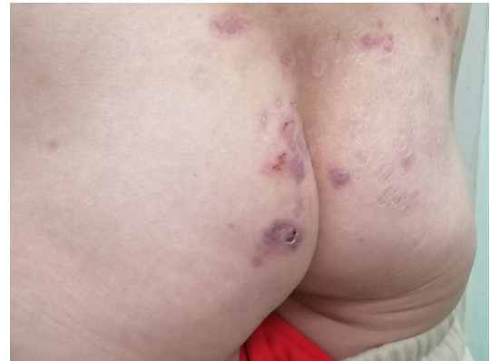
Fig.1: Erythema, blisters and scab lesions in buttock area.

SLE is a chronic autoimmune disease which is characterized by the presence of auto-antibodies against nuclear antigen, immune complex deposition and tissue damage in skin, kidney, heart and lungs [3]. Pemphigus is also an auto immune disease which has clinical manifestation of intra-epidermal blistering of the skin and/or